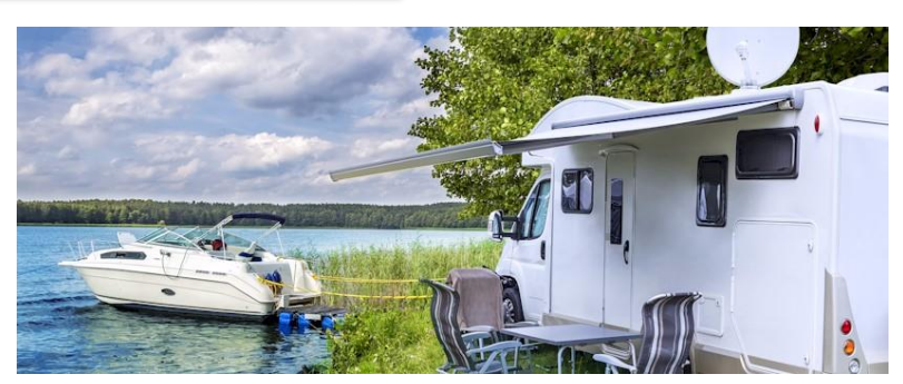
Marine & RV