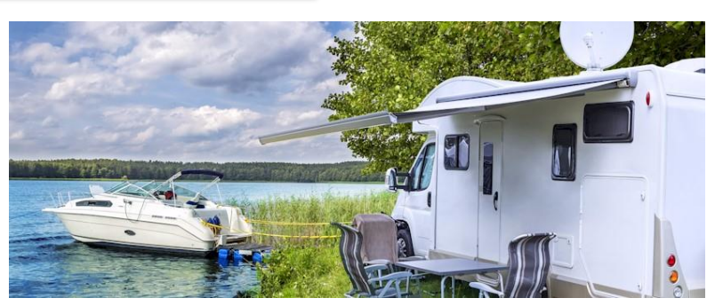
Marine & RV