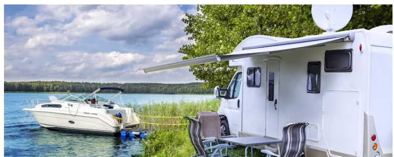
Marine & RV